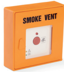
SCU-CP Override Switch