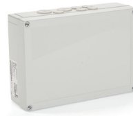
PSU-2/4/8 24V DC Transformer