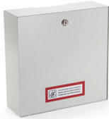
SCU-4 AOV Control Unit