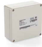
SYNCHRO24 Tandem Control Unit