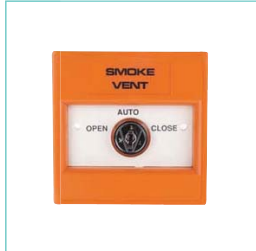
BG2/FOS/O Override Switch