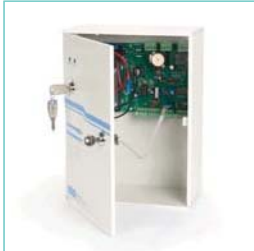
VCS-S1 AOV Control Unit