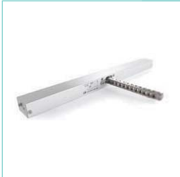
WMU 836 Chain Actuator