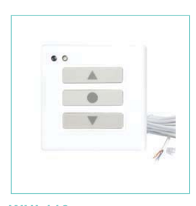
WUI 110 Ventilation Keypad